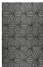
Carpet Oria hand-tufted virgin wool e.g. 120 x 180 cm 499,00 Euro