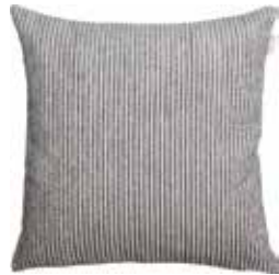
Cushion Softly 45 x 45 cm / € 19,99