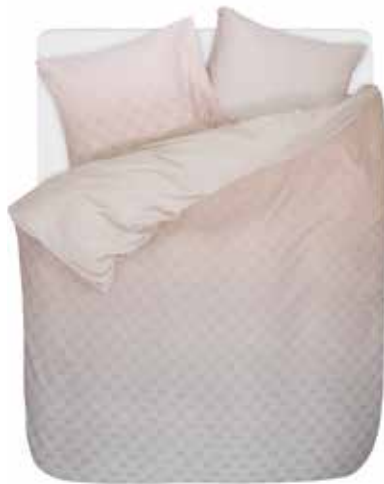
Bed linen Nouni e.g. 135/200 cm + 80/80 cm € 69,95