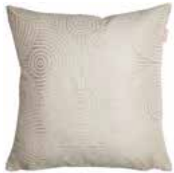
Cushion Cycle 38 x 38 cm / € 24,99