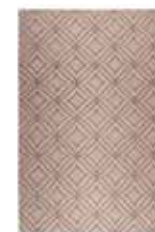
Arvid Kelim hand-woven virgin wool GoodWeave label e.g. 130 x 190 cm 199,00 Euro