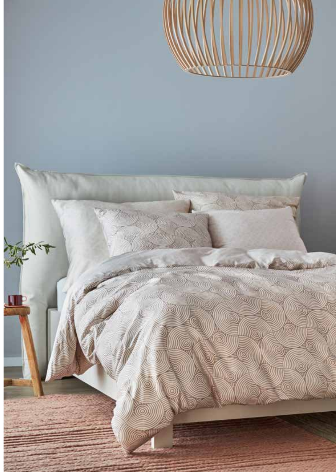
Bed linen Coy e.g. 135/200 cm + 80/80 cm / 69,95