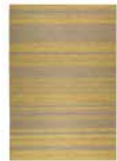
Hudson Kelim 3 colors available hand-woven virgin wool GoodWeave label e.g. 130 x 190 cm 299,00 Euro