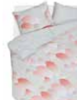
Bed linen Waves 100% cotton/sateen e.g. 135/200 cm + 80/80 69,95 Euro