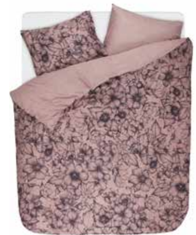
Bed linen Maray e.g. 135/200 cm + 80/80 cm € 69,95