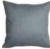
Cushion Mini 3 colors available 38x38 cm 19,99 Euro