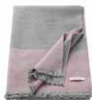
Plaid Shift 2 colors available 150x200 cm 89,99 Euro