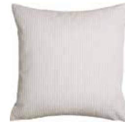
Cushion Softly 45 x 45 cm / € 19,99