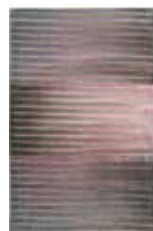
Carpet Lidija 2 colors available 100% polypropylene heatset frisée e.g. 133 x 200 cm 149,00 Euro