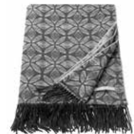
Plaid Starfleur 140x200 cm / € 89,99