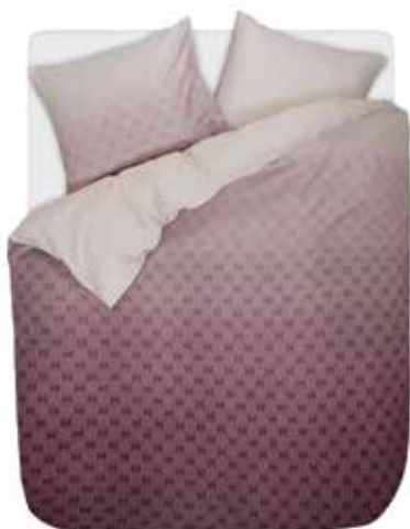
Bed linen Nouni e.g. 135/200 cm + 80/80 cm € 69,95