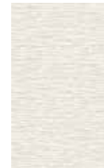
Wallpaper Eccentric luxury 3 colors available vlies wallpaper with texture 0,53x10,05 m (5,33 sq m) 23,95 Euro