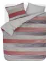
Bed linen Bravo 100% cotton/percale e.g. 135/200 cm + 80/80 49,95 Euro