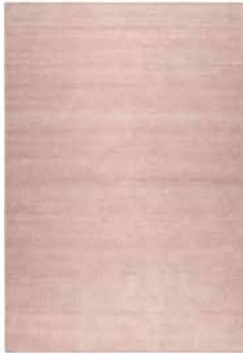
Maya Kelim e.g. 133 x 200 cm / € 199,00