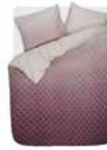
Bed linen Nouni 3 colors available 100% cotton/sateen e.g. 135/200 cm + 80/80 69,95 Euro