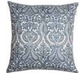
Cushion Hilary 45 x 45 cm / € 22,99