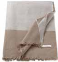
Plaid Shift 150 x 200 cm / € 89,99