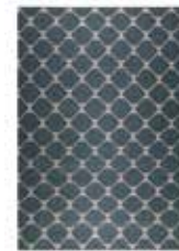
Aaron Kelim 2 colors available hand-woven virgin wool GoodWeave label e.g. 130 x 190 cm 269,00 Euro