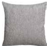
Cushion Softly 2 colors available 45x45 cm 19,99 Euro