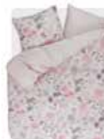
Bed linen Sara 100% cotton/sateen e.g. 135/200 cm + 80/80 69,95 Euro