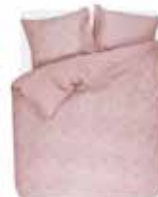
Bed linen Coy 2 colors available 100% cotton/sateen e.g. 135/200 cm + 80/80 69,95 Euro