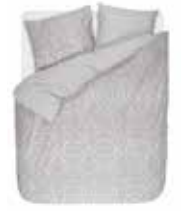
Bed linen Hillary 100% cotton/flannel e.g. 135/200 cm + 80/80 69,95 Euro