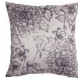
Cushion Madleine 45 x 45 cm / € 22,99