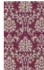
Wallpaper Eccentric luxury 3 colors available non-woven vlies wallpaper 0,53x10,05 m (5,33 sq m) 27,95 Euro