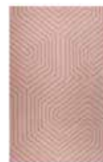
Carpet Raban hand-tufted virgin wool e.g. 120 x 180 cm 499,00 Euro