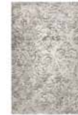
Carpet Elda machine-woven e.g. 120 x 170 cm 149,00 Euro