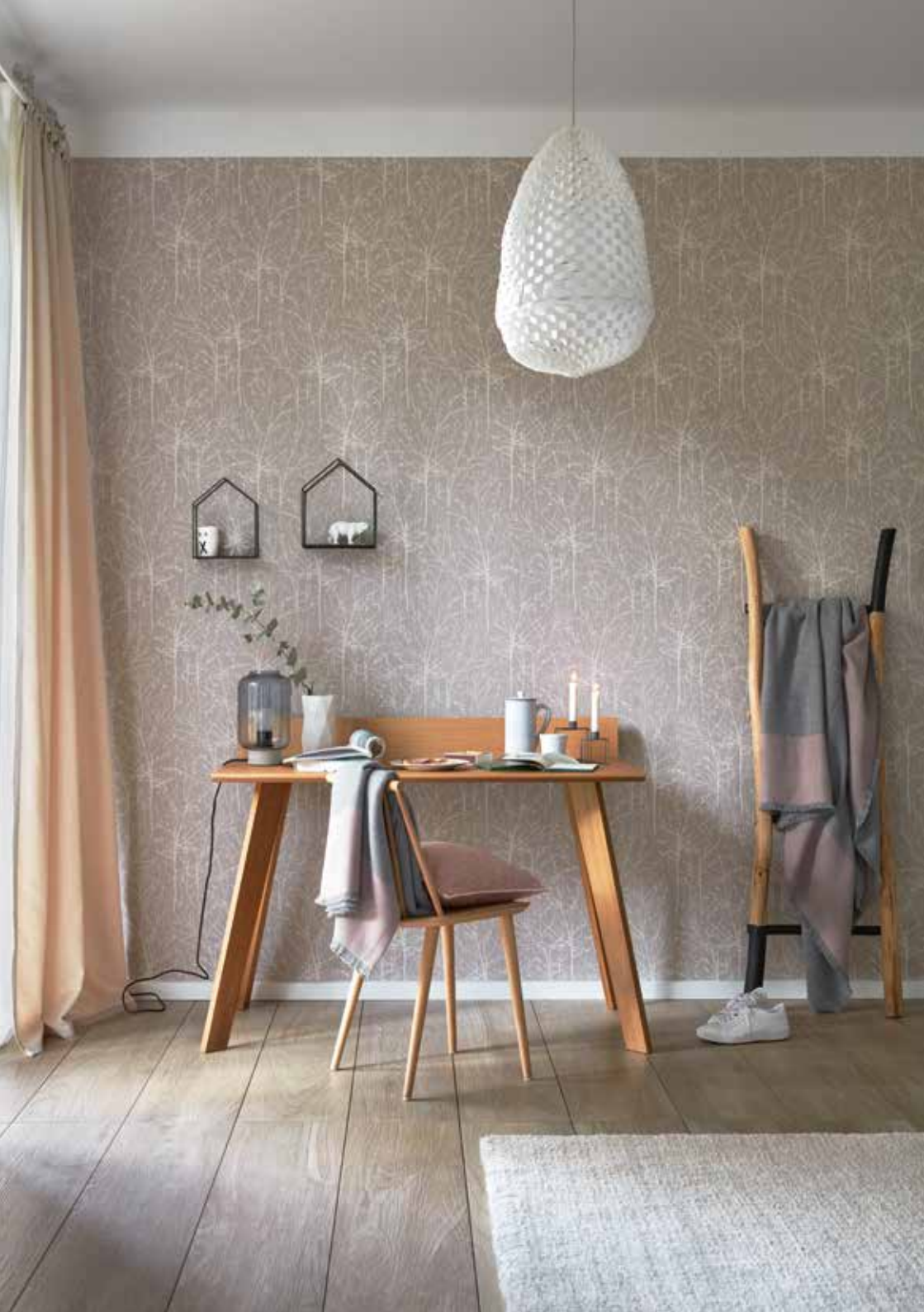
Wallpaper Minimalistic authenticity 0,53 x 10,05 m (5,33 sqm) / € 21,95