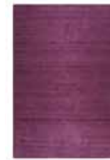
Maya Kelim 7 colors available hand-woven cotton wool GoodWeave label e.g. 130 x 190 cm 269,00 Euro