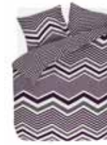
Bed linen Ziggy Zag 2 colors available 100% cotton/flannel e.g. 135/200 cm + 80/80 49,95 Euro