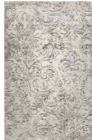
Carpet Elda e.g. 133x200 cm / € 199,00