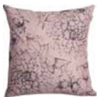
Cushion Madleine 3 colors available 45x45 cm 22,99 Euro