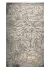
Carpet Tera 50% polypropylene 50% polyester e.g. 133 x 200 cm 199,00 Euro