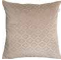
Cushion Romo 2 colors available 45x45 cm 24,99 Euro