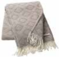
Plaid Daria 2 colors available 140x200 cm 79,99 Euro