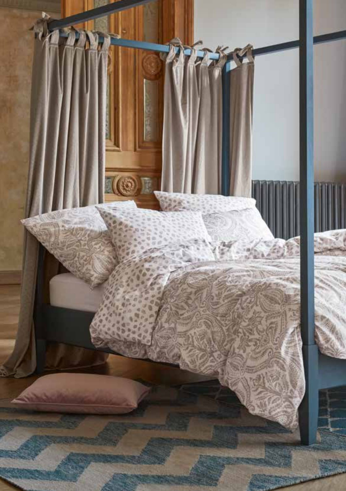
Bed linen Hillary e.g. 135/200 cm + 80/80 cm / € 69,95