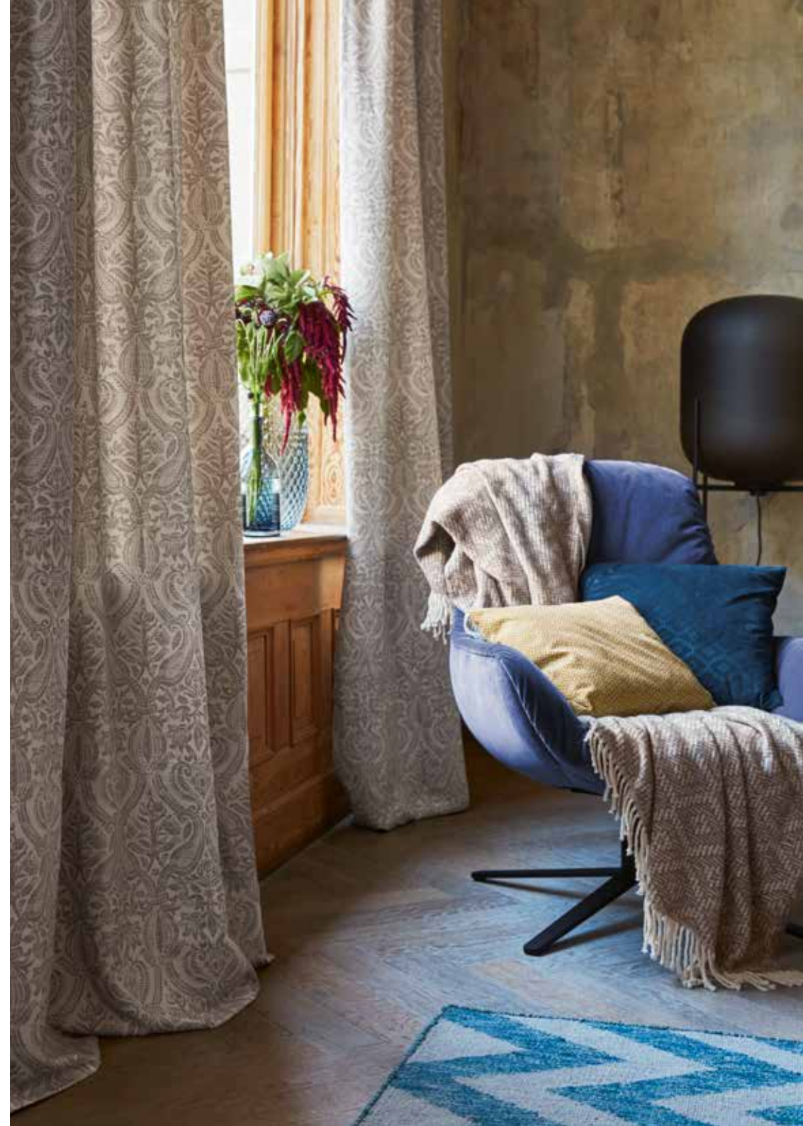
Curtain Hilary 140 x 250 cm / € 69,99 Plaid Daria 140 x 200 cm / € 79,99