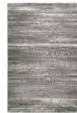
Carpet Makai machine-woven e.g. 120 x 170 cm 149,00 Euro