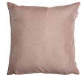
Cushion Cycle 38x38 cm / € 24,99