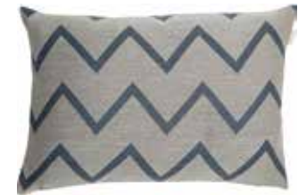
Cushion Zoro 38x58 cm / € 29,99