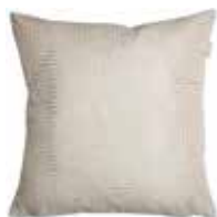
Cushion Cycle 3 colors available 38x38 cm 24,99 Euro

All prices in this brochure are German recommended retail prices and may vary from country to country.