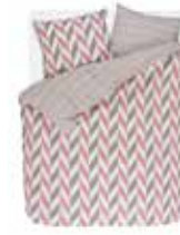
Bed linen Criss Cross 2 colors available 100% cotton/flannel e.g. 135/200 cm + 80/80 49,95 Euro