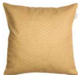
Cushion Mini 38 x 38 cm / € 19,99