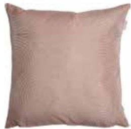
Cushion Cycle 38 x 38 cm / € 24,99