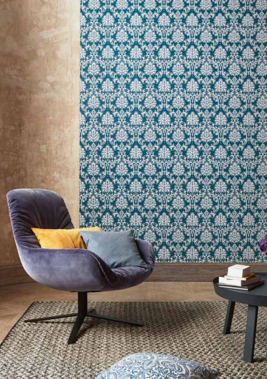
Wallpaper Eccentric luxury 0,53x10,05 m (5,33 sq m) / € 27,95