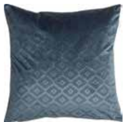
Cushion Romo 45 x 45 cm / € 24,99