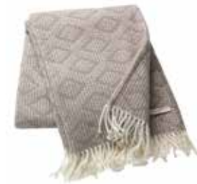
Plaid Daria 140x200 cm / € 79,99