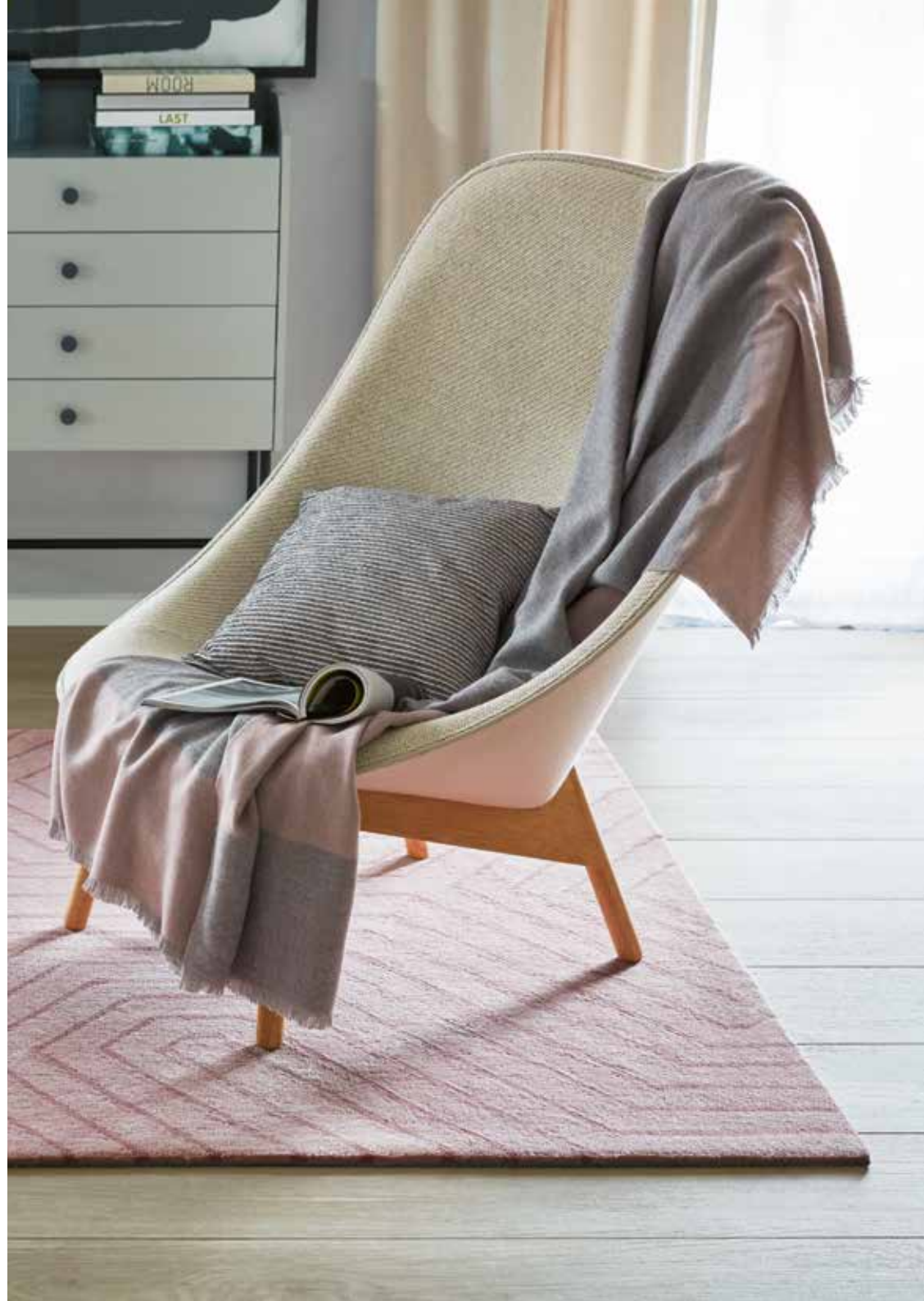
Carpet Raban e.g. 120 x 180 cm / € 499,00