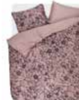
Bed linen Maray 100% cotton/sateen e.g. 135/200 cm + 80/80 69,95 Euro