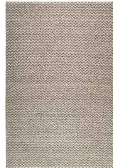
Sandi Kelim e.g. 130x190 cm / € 269,00