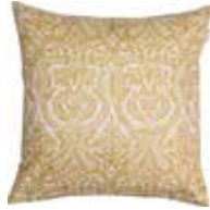
Cushion Hilary 3 colors available 45x45 cm 22,99 Euro