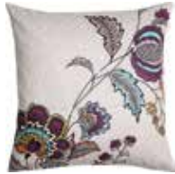
Cushion Flores back beige 45x45 cm 22,99 Euro

All prices in this brochure are German recommended retail prices and may vary from country to country.