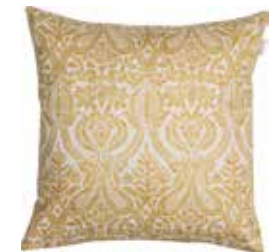
Cushion Hilary 45 x 45 cm / € 22,99