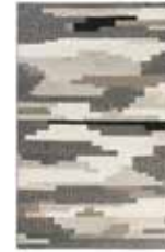
Natham Kelim 2 colors available hand-woven virgin wool GoodWeave label e.g. 130 x 190 cm 299,00 Euro