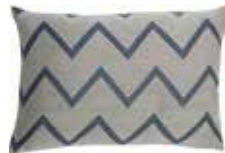
Cushion Zaro 2 colors available 38x58 cm 29,99 Euro