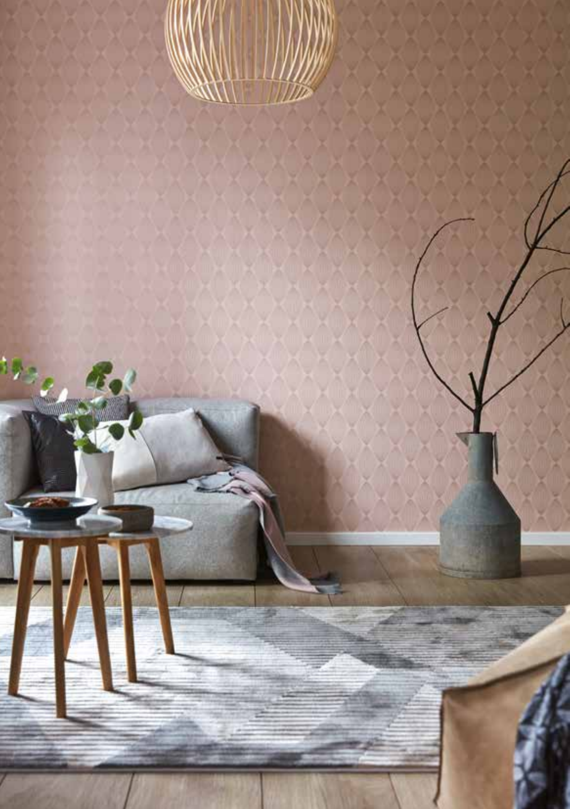
Wallpaper Minimalistic authenticity 0,53x10,05 m (5,33 sq.m) / € 23,95 Carpet Tamo e.g. 133x200 cm / € 199,00