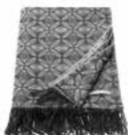
Plaid Starfleur woven jacquard design 140x200 cm 89,99 Euro