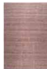
Maya Kelim 7 colors available hand-woven cotton wool GoodWeave label e.g. 130 x 190 cm 269,00 Euro