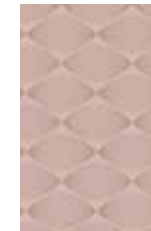
Wallpaper Minimalistic authenticity 3 colors available vlies wallpaper shimmery 0,53 x 10,05 m (5,33 sq m) 23,95 Euro