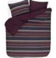
Bed linen Valiar 2 colors available 100% cotton/flannel e.g. 135/200 cm + 80/80 49,95 Euro