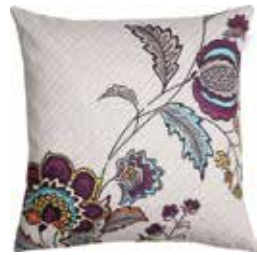
Cushion Flores 45 x 45 cm / € 22,99