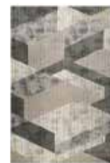
Carpet Tamo 50% polypropylene 50% polyester e.g. 133 x 200 cm 199,00 Euro