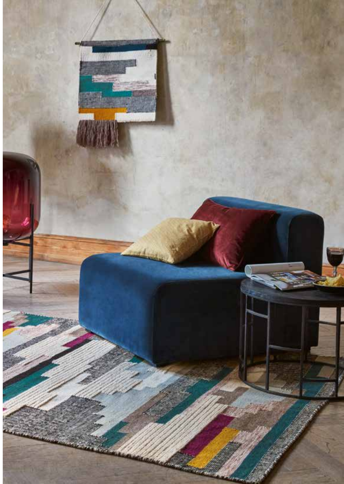
Natham Kelim e.g. 130 x 190 cm / € 299,00