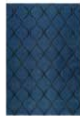
Carpet Aramis 4 colors available hand-tufted virgin wool e.g. 90 x 160 cm 339,00 Euro