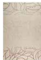
Carpet Tenya 2 colors available hand-tufted virgin wool e.g. 120 x 180 cm 499,00 Euro