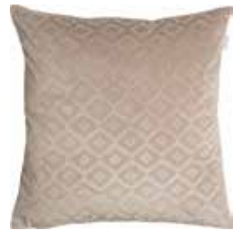
Cushion Romo 45 x 45 cm / € 24,99